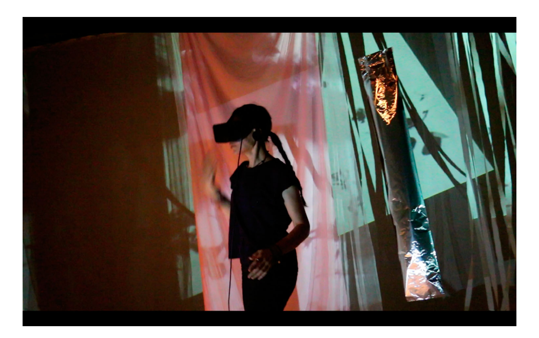
Figure 1. Visitor wandering through augmented virtuality environment, with her right hand feeling imaginary resistance. CNDP Bucharest, 2018 © DAP-Lab.