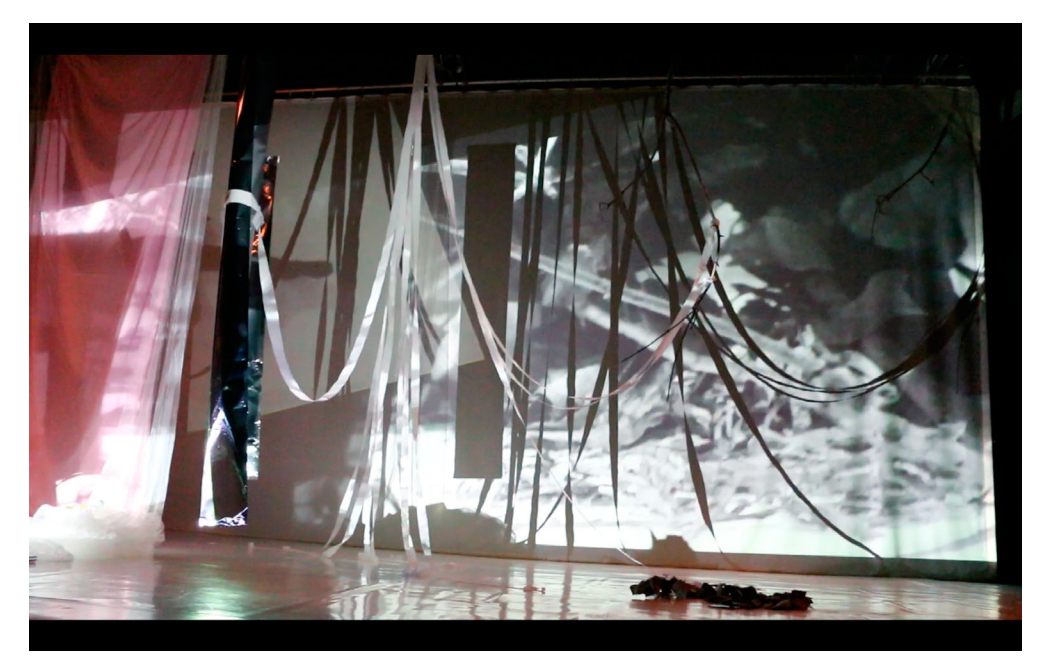
Figure 4. Augmented reality/digital forest. 'Constructing Realities' workshop. CNDP Bucharest, 2018 © DAP-Lab.