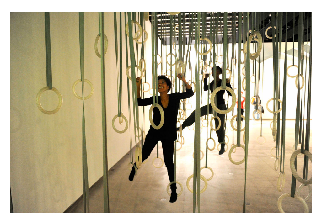
Figure 3. Visitors playing in William Forsythe's choreographic object The Fact of Matter , installation at Move: Choreographing You , Hayward Gallery, Southbank Centre, London, 2010–2011.