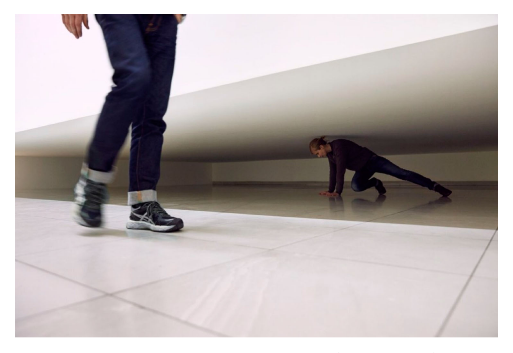
Figure 2. William Forsythe, A Volume, within which it is not Possible for Certain Classes of Action to Arise, 2015, MMK Museum für Moderne Kunst Frankfurt.