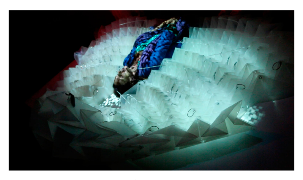
Figure 9. Visitor having dived into coral reef and watery projection, kimosphere no.4 © DAP-Lab.

a scenographic strategy engaging audiences to step inside and come closer, touch, listen and act in greater intimacy with unfolding actions. They are breathing spaces, currents felt through sonorous, tactile connections. Surfaces and the blurring of the physical-virtual boundary require a creative investment from the audience, particularly in the case of the VR masks that need to be worn.