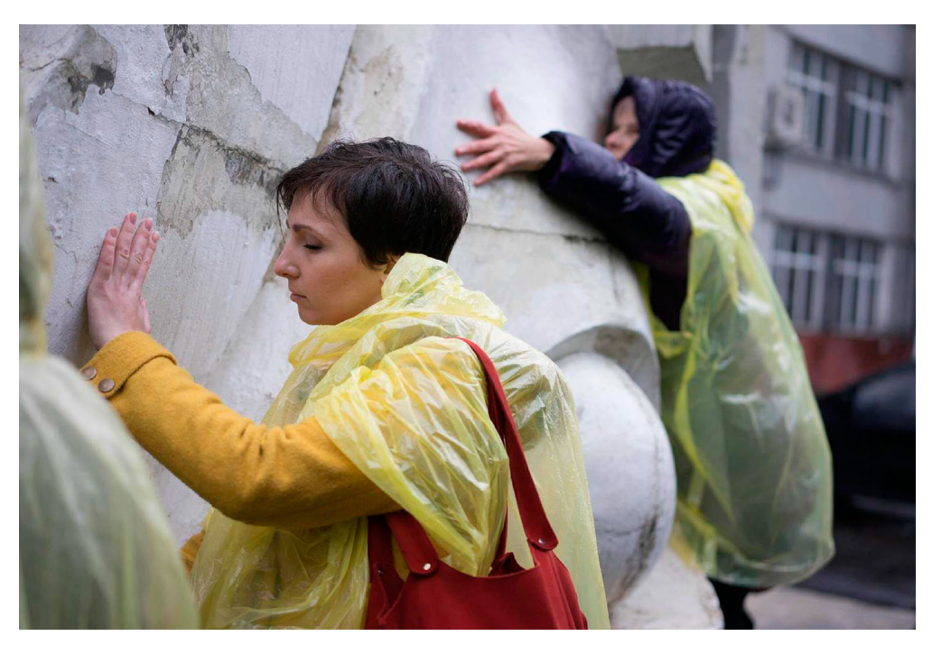
Figure 6. Tactile Dialogues (Vadim Sidur), curated by Fayen d'Evie and Shelley Lasica with Irina Povolotskaya, 2016.