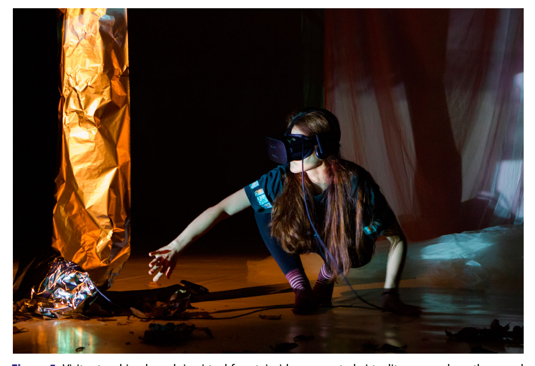
Figure 5. Visitor touching branch in virtual forest, inside augmented virtuality space where the sound of the suspended silver foil creates a rustling (of leaves). CNDP Bucharest, 2018