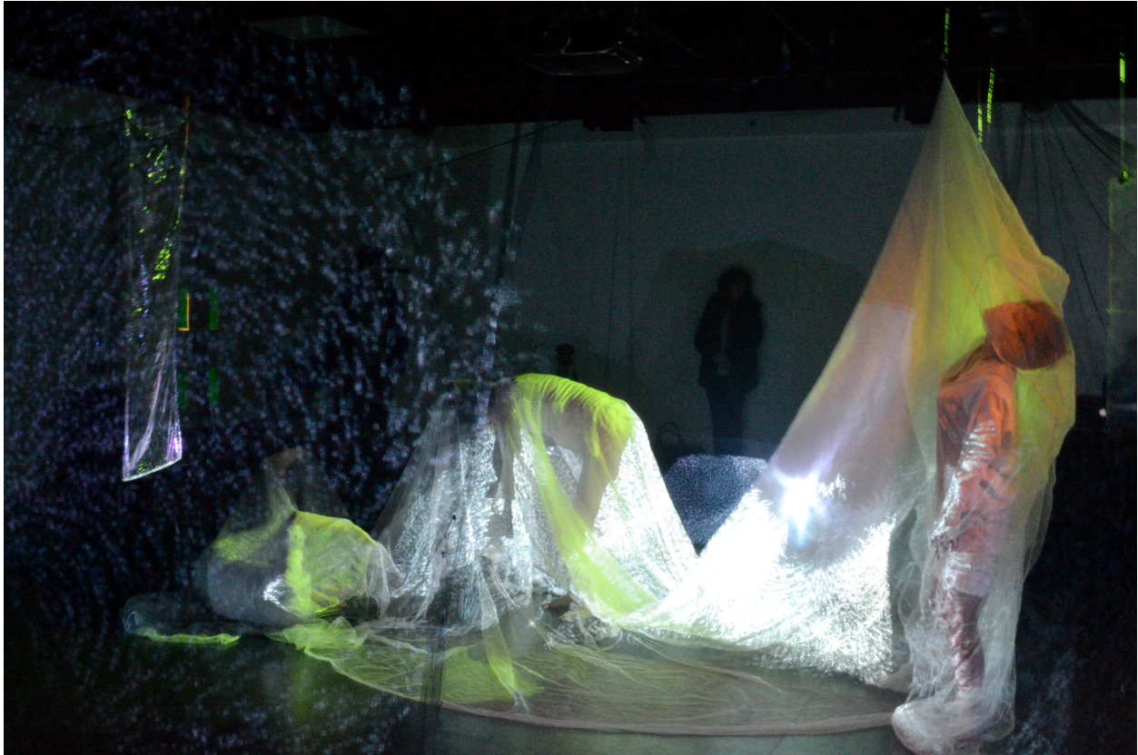
Fig. 1 Metakimosphere no. 1 , created by DAP-Lab, Artaud Performance Center, Brunel University London, 2015. © DAP-Lab

The elemental thereness of the atmosphere includes the audience as experiencers who are ‘inside’ the atmosphere, and the atmosphere in them. Meta : through them. Both, so to speak, reciprocally make up the materiality of the interaction merger. There is black porous gauze on the perimeter, and soft white veil net inside, and these insides-outsides are housed inside a darkened gallery-studio space (ca. 10 by 12 meters wide). This was the first envelope, for a test performance in London in March 2015. Later that summer, the second envelope was a huge auditorium in the Medialab Prado, Madrid. The envelope is to be developed further, envisioned as an architectural skin with its own properties and behaviors. The current studio-envelopes are test sites, in the future meant to grow into a pavilion – a dynamic spherical environment. The current kimosphere we have created has tighter, narrower skins; these skins are also a kind of costume that stretches close and far between, an entangling fabric that can be touched, grasped,