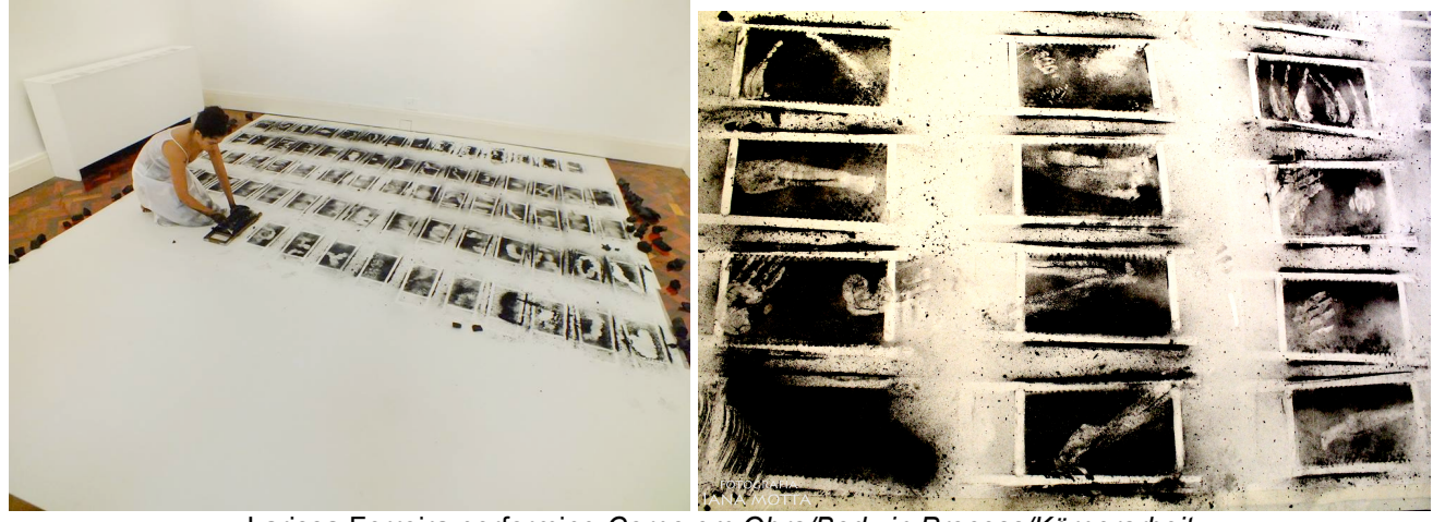
Larissa Ferreira performing Corpo em Obra/Body in Process/Körperarbeit

Anna Troisi (Bournemouth University): OB Scene. The work is conceived as a sound performance where a self made medical (vaginal) probe is used to transform female sexual arousal into sound, intruding the performer's body. Data are transformed live into sound through original software.