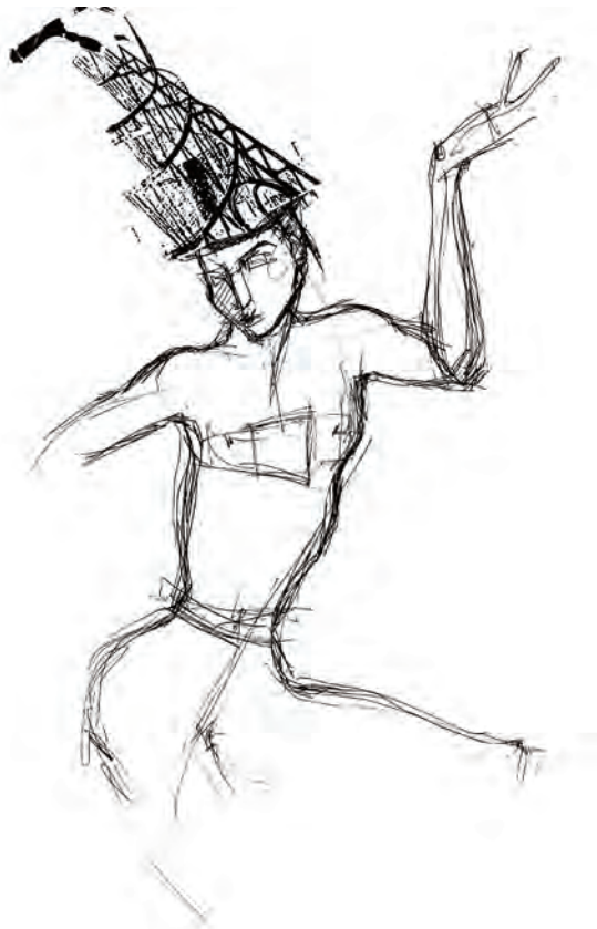
Figure 3: Design sketch for the TatlinTower Headdress © 2012 Michèle Danjoux.