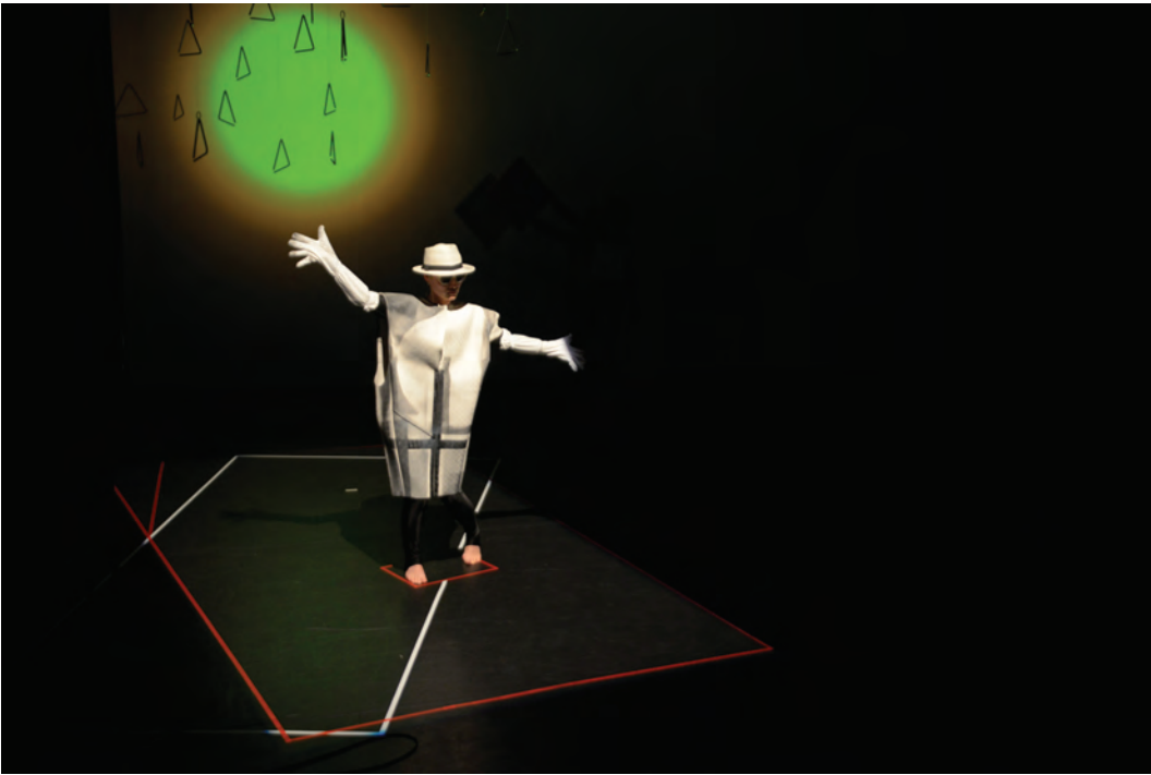
Figure 7: For the time being, Sadler's Wells, 2014. Ren wearing GraveDigger enacts the role of sun-trapper, in 'Killing of the Sun' scene.