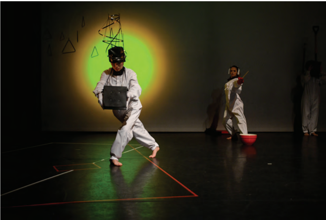
Figure 6: For the time being, Sadler's Wells, 2014. Ren performing radio transmissions in TatlinTower, Scene 1 (Photo © Antonio Pagano).

Michielon expands further on the sensorial aspects of the design for her, noting how the physical presence of the instrument on her body, its tactility, weight and sounding caused her to move in certain ways whilst creating other affects and imaginary scenarios that acted as further motivations to her movements: