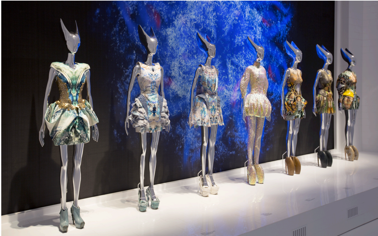
Fig.1 Installation View of Alexander McQueen: Savage Beauty at the V&A.

McQueen's runway shows captured my interest from the very moment I stepped into the first gallery of the London exhibition. Never having experienced one live, I was forced to make my own montage of impressions culled from the large, wall-sized projection of slow-motion footage, with some incredibly alluring and disturbing images of models asymmetrically adorned in fashion that left their flesh exposed, one breast hanging out, shirts sliced, heads shaven, contorted toughness and aggressive postures mixed up with pain built into the addenda, the jewellery, the braces. There was something about the postures that struck me and that I could not pin down. These images were splayed over the mannequins with the dresses from the early 1990s (e.g. The Birds ; Highland Rape ), and so I watched film while perusing the materials silently hanging there: synthetic lace, leatherette, metal studs, tyre-tread prints, lock of hair. Later I composed my Eisensteinian montage from the innumerable video monitors, stacked on shelves inside cubicles all over the Wunderkammer (cabinet of curiosities), the double-height room near the end of the V&A's Savage Beauty .